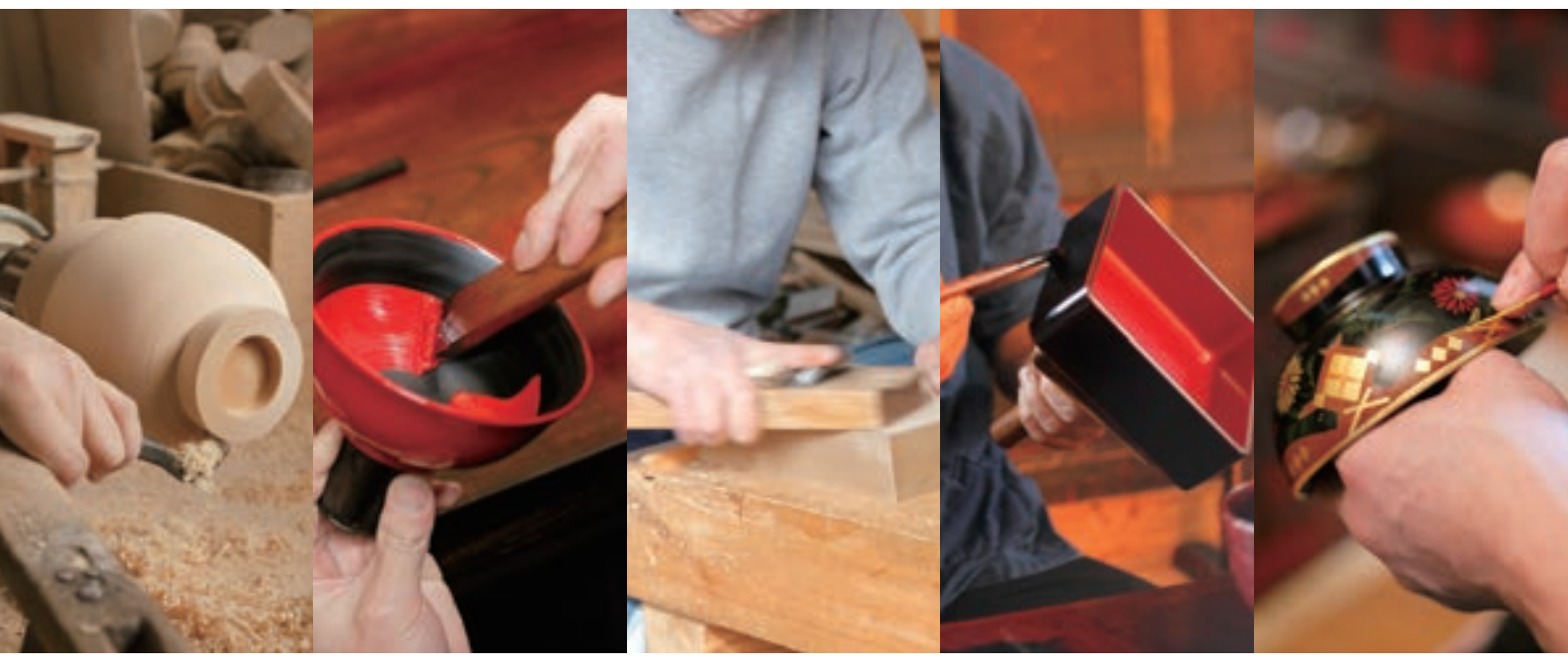
Urushi: lacquer, a naturally-occurring sap taken from the Urushi tree