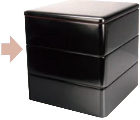
The three-tiered box is now finished.